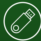
USB/ FLASH DRIVE