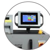
3- Collection Bin