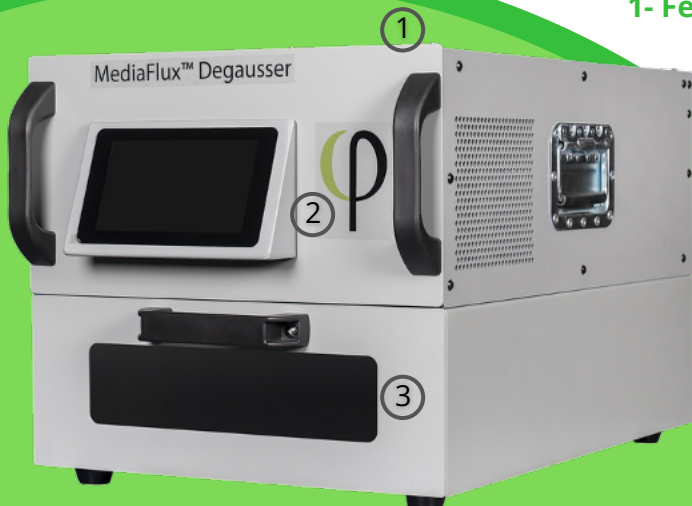
1- Feed Port