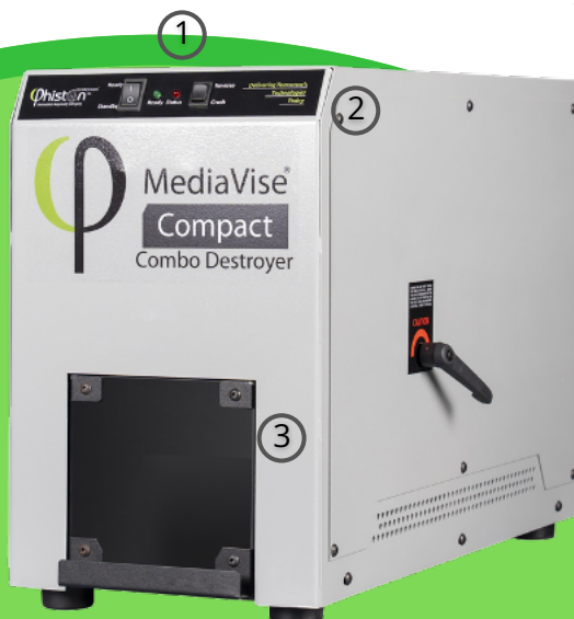
1- Feed Port