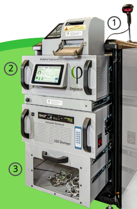
1- Feed Port